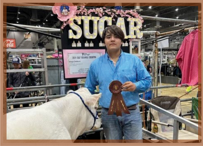
Our 2023 Calf Scramble Winner showing at the 2024 HLSR.